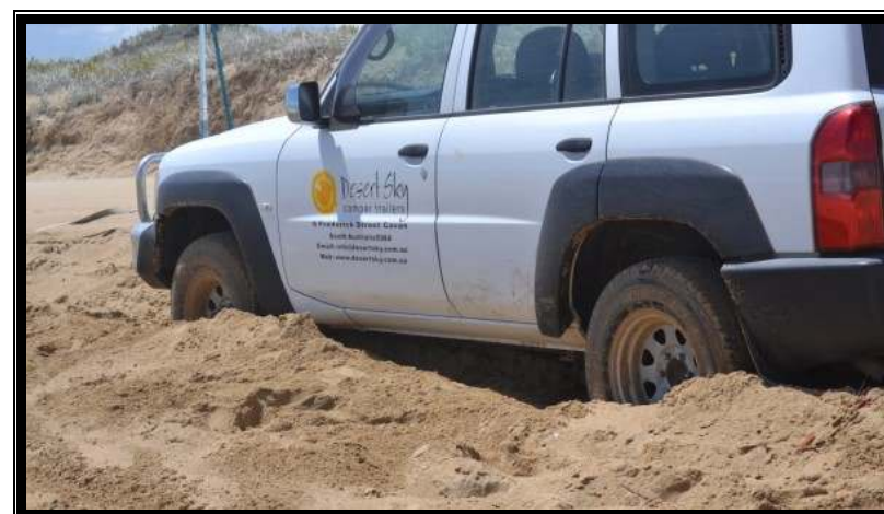
Rudi's Patrol stuck on the beach after assisting in the recovery of another vehicle. (Beachport trip)